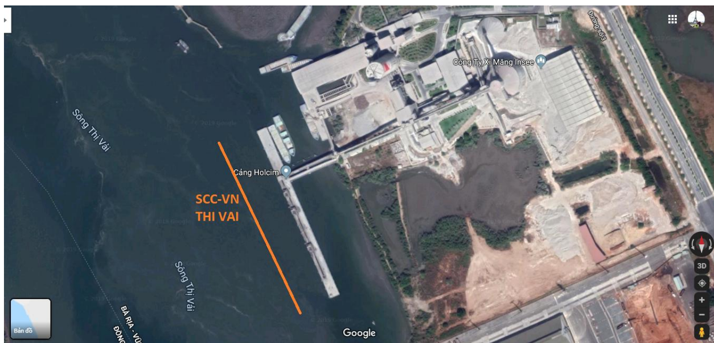
SCC-VN THI VAI PORT